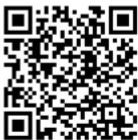
M&S competition webpage