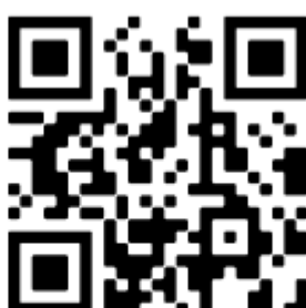
YoungMinds parent and carer resources